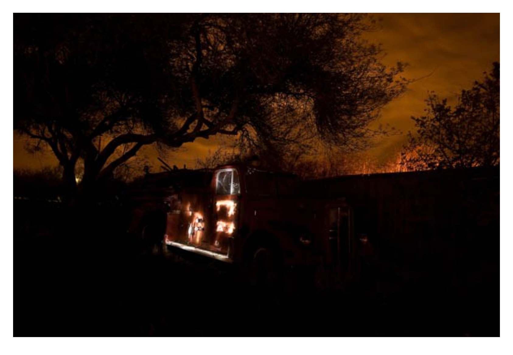
Lighting the side panel and running board, notice how I've highlighted