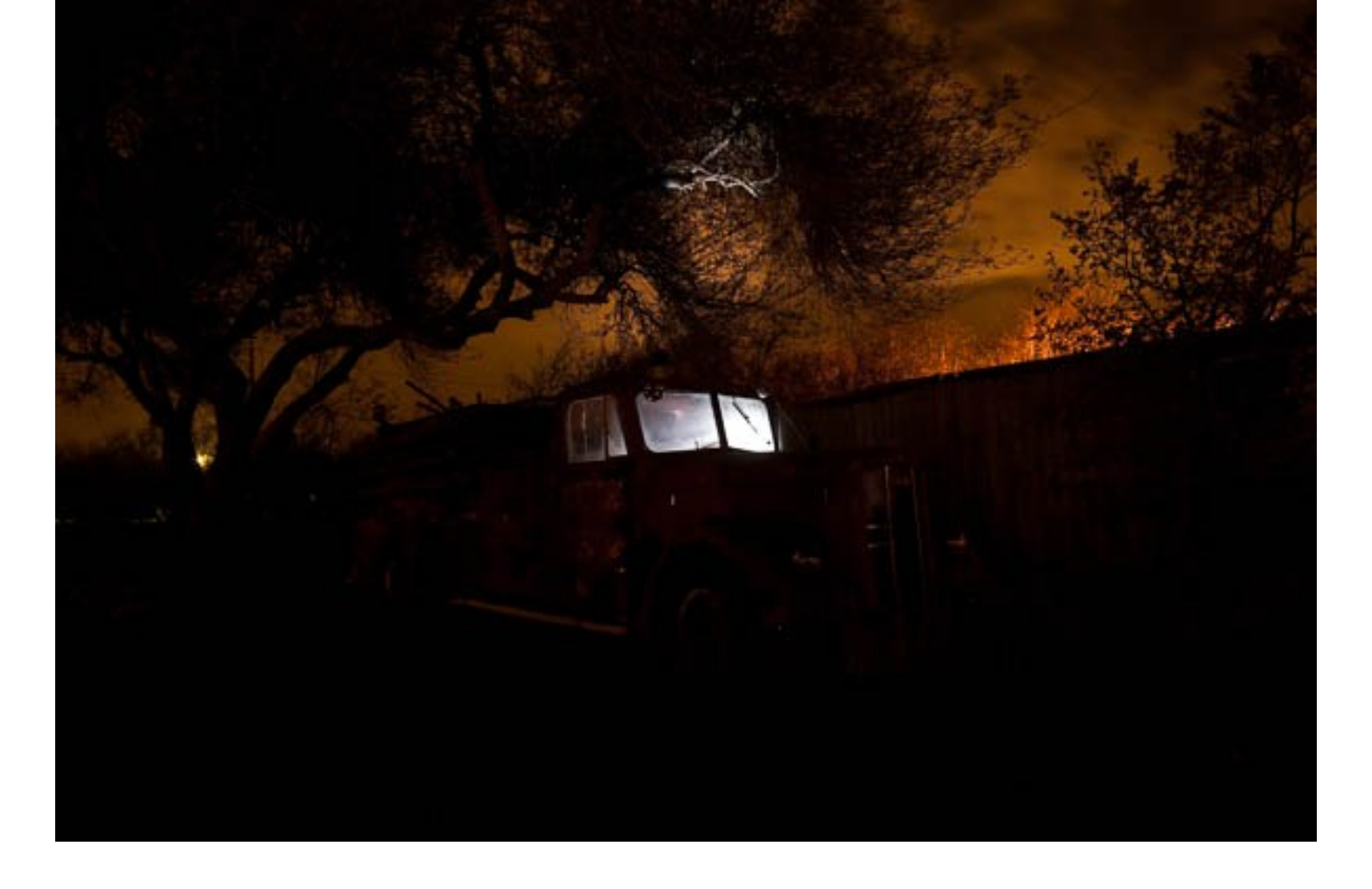
Lighting up the windows from the inside! A little of the tree branch too.