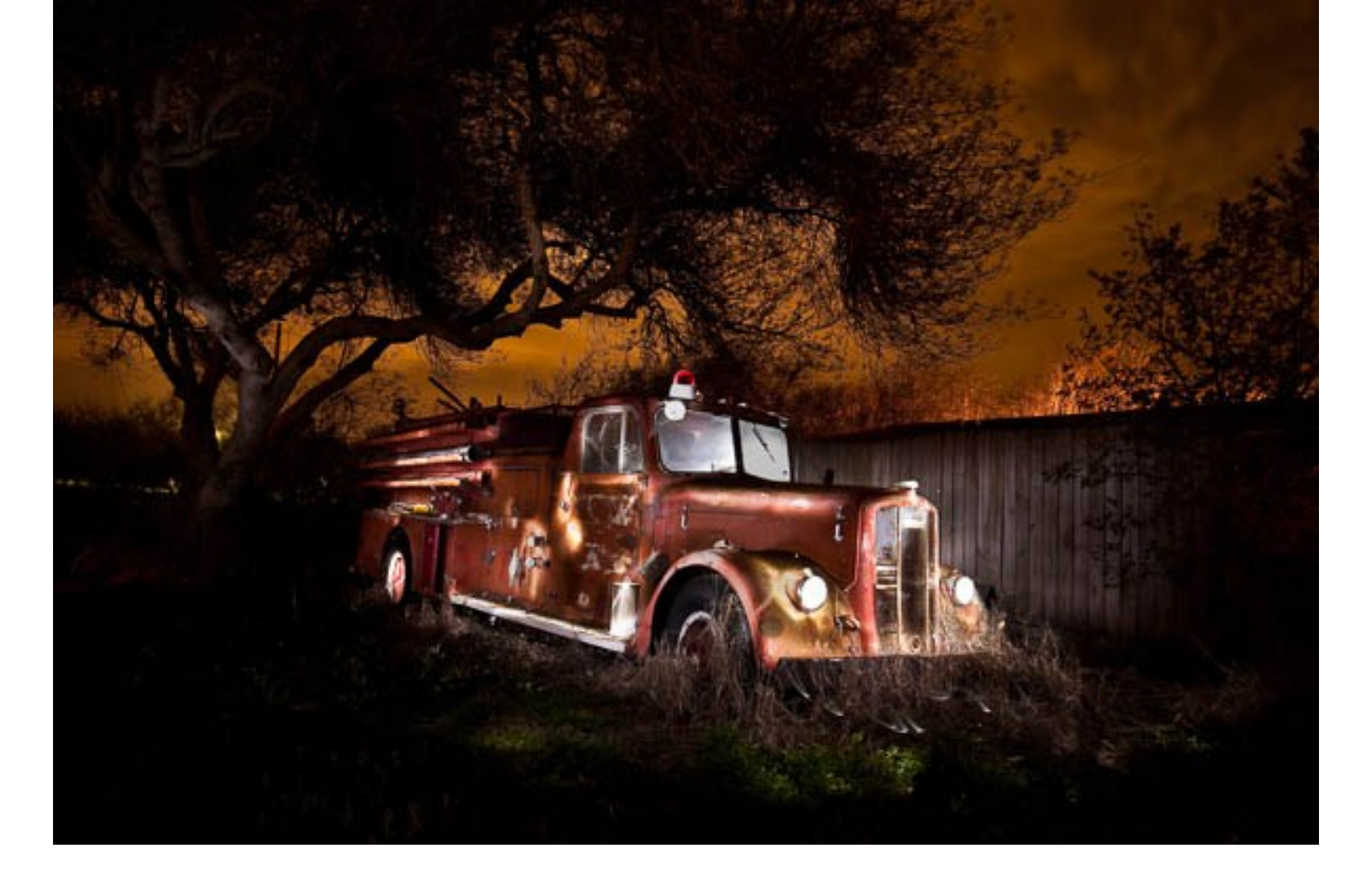
"1956 Le France Pumper" Corpus Christi, Texas