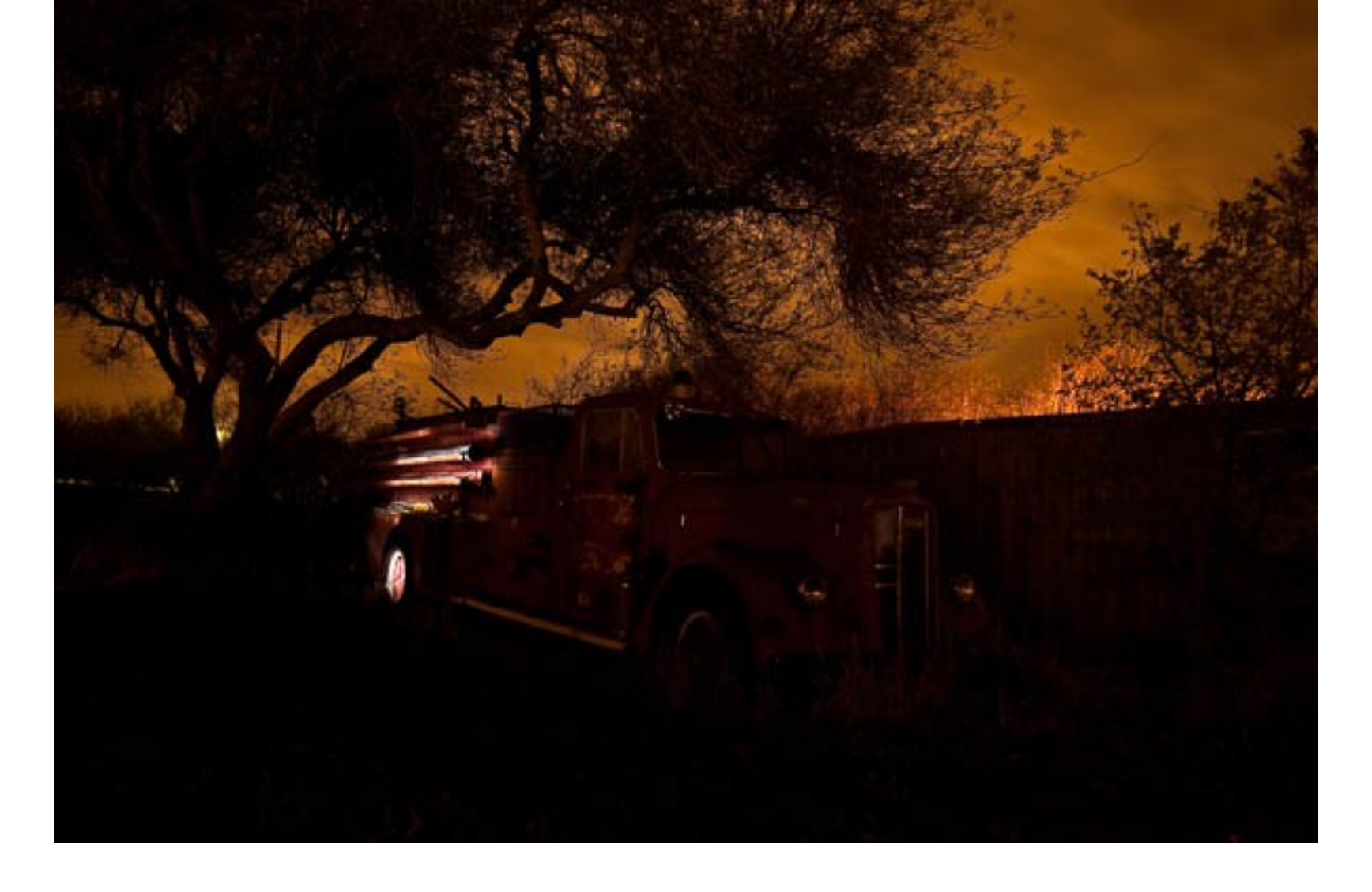
Lighting the back area where the hoses are and the back tire