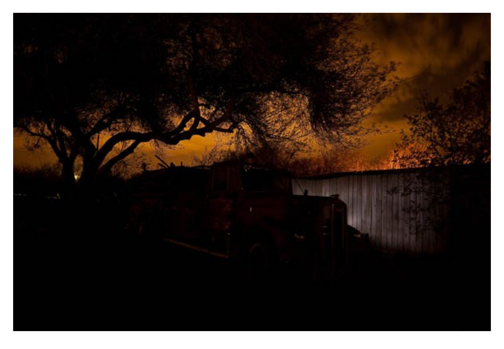
Lighting the fence behind the truck to give it separation