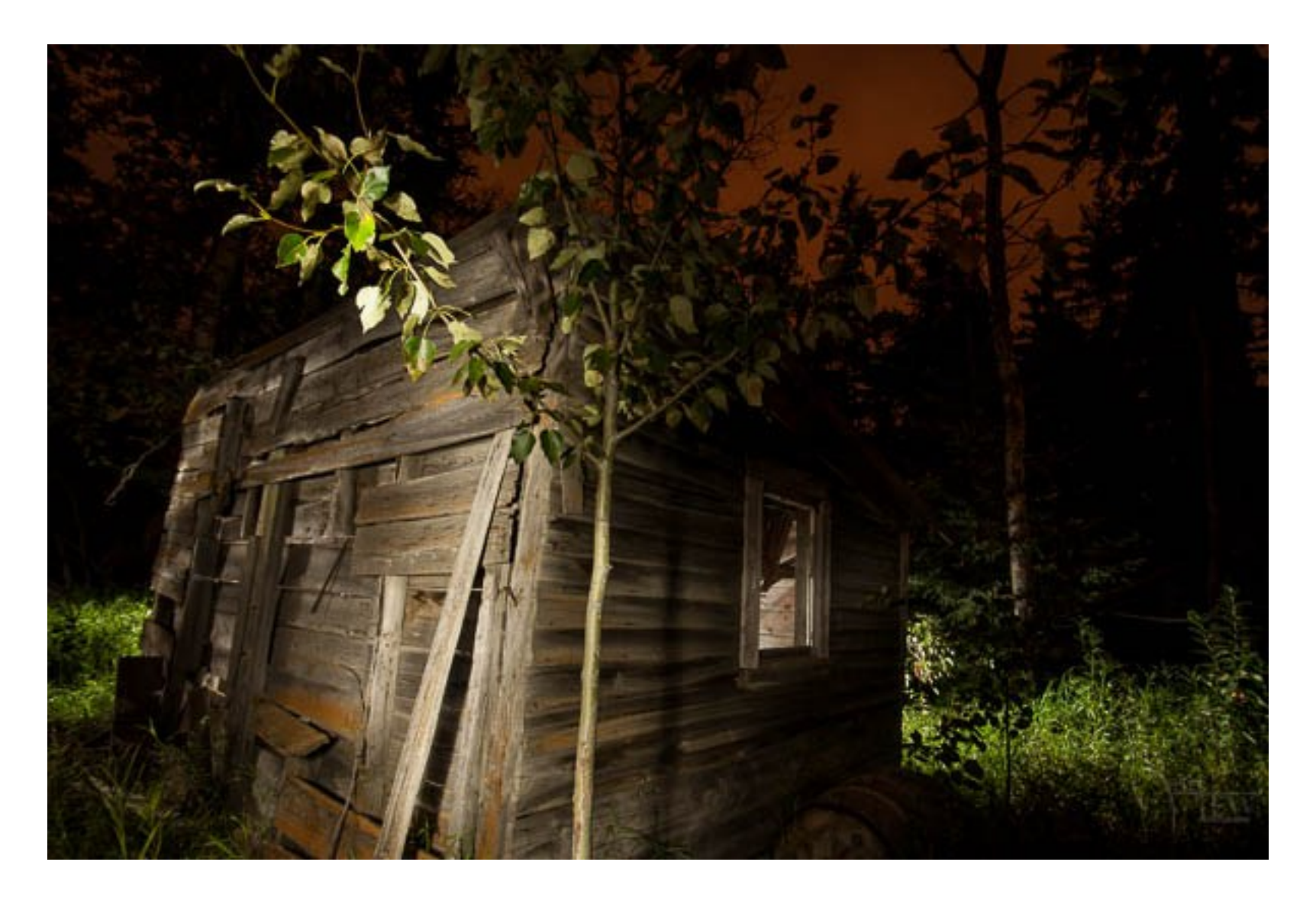
Light painted from a few feet away from the shack with a wider beam flashlight